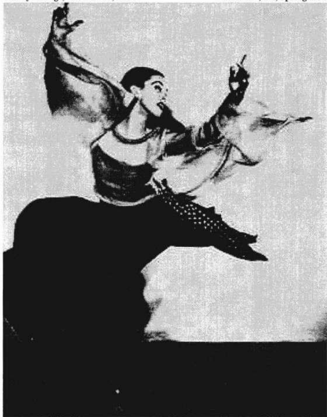
Martha Graham Harlequinade 1930 (solo)