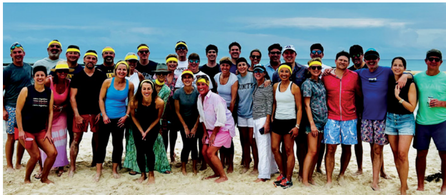
Several members of the Class of 1995 enjoy the beach in Mexico in February 2023 to celebrate their 50th birthdays. After dinner, they held the finals of the “blue-gold Olympics.”

offices in Cairo, Egypt; Auckland, New Zealand, and Cork, Ireland. Lots of fun, family, and work. If anyone is headed to Miami in the future, I'd love to hear from you!”