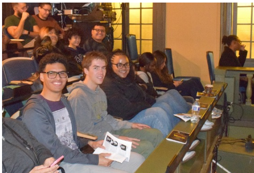
FYSM at El Repertorio Español, NYC. ↓