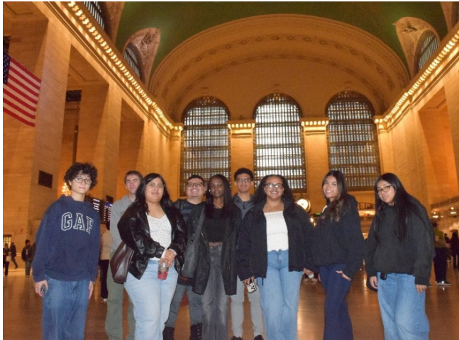
↑Students and Mentor at Grand Central Terminal, NYC.

The participants in the seminar were a microcosm of the student population at Trinity and a reflection of the diverse topics we covered. International students coming from Latin America, Hispanic Americans, and non-Latino students all engaged in this