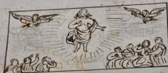
Ascension of Jesus.

ᐃᐱ ᐱᐱ ᐃᐱ ᐃᐱ ᐃᐱ ᐃᐱ ᐃᐱ ᐱᐱ ᐃᐱ ᐃᐱ ᐃᐱ ᐃᐱ ᐃᐱ ᐱᐱ ᐃᐱ ᐃᐱ ᐃᐱ ᐃᐱ ᐃᐱ ᐱᐱ ᐃᐱ ᐃᐱ ᐃᐱ ᐃᐱ ᐃᐱ ᐱᐱ ᐃᐱ ᐃᐱ ᐃᐱ ᐃᐱ ᐃᐱ ᐱᐱ ᐃᐱ ᐃᐱ ᐃᐱ ᐃᐱ ᐃᐱ ᐱᐱ ᐃᐱ ᐃᐱ ᐃᐱ ᐃᐱ ᐃᐱ ᐱᐱ ᐃᐱ ᐃᐱ ᐃᐱ ᐃᐱ ᐃᐱ ᐱᐱ ᐃᐱ ᐃᐱ ᐃᐱ ᐃᐱ