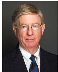
George F. Will