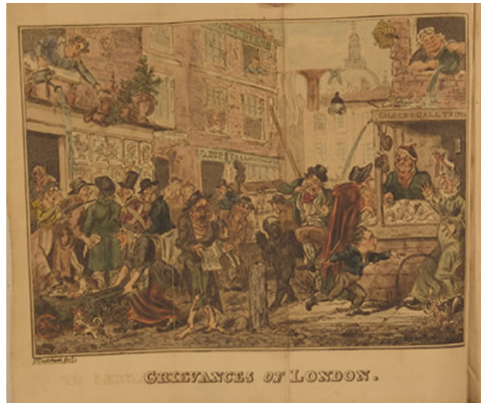
Illustrated by George Cruikshank