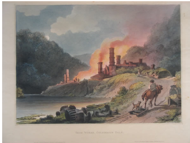
Iron works at Colbrook Dale